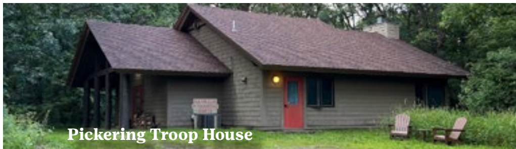
Pickering Troop House