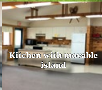
Kitchen with movable island