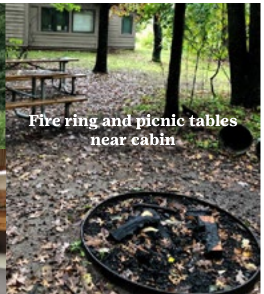
Fire ring and picnic tables near cabin