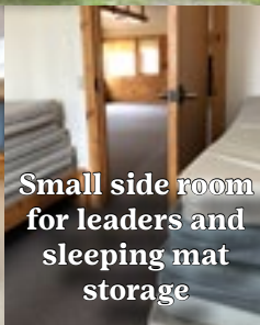
Small side room for leaders and sleeping mat storage