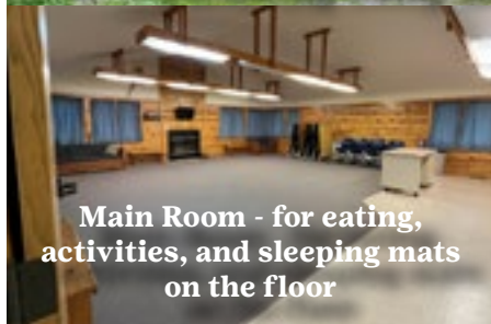
Main Room - for eating, activities, and sleeping mats on the floor