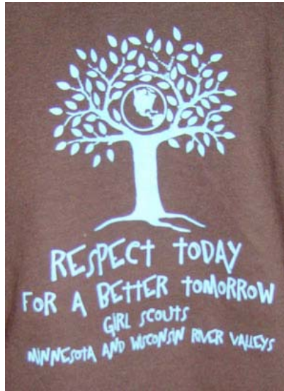
"Respect Today for a Better Tomorrow" long sleeve T-shirt. Dark brown with blue screen print. Small – X-Large $16, 2X $18.