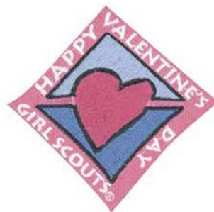
Embroidered with faux fur Valentine heart patch, $2.

Look what's new in the Girl Scout Shop .